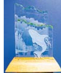
LEFT 3D Custom Foam's ingenuity and innovation in product design as well as other business activities was recently recognized.